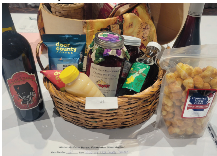
Door County Farm Bureau sponsored a basket for the silent auction, "A Taste of Door County".