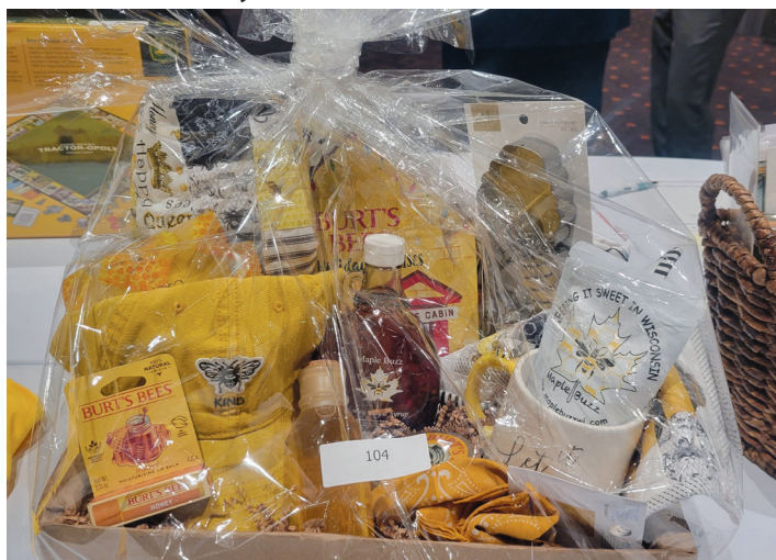
Honey and Maple Syrup basket donated by Brown County Farm Bureau for the Silent Auction.