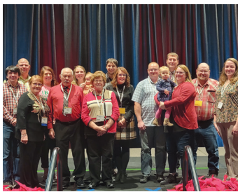
Manitowoc YFA and county delegates representing Manitowoc County Farm Bureau at the WFBF Annual Meeting.