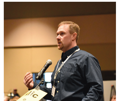
Several District 6 members took to the microphone to work on policy during the Monday resolution session.