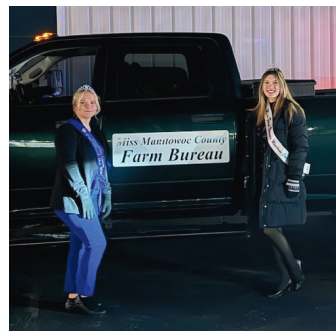
Manitowoc County Miss Farm Bureau prepares for a Christmas parade in December.