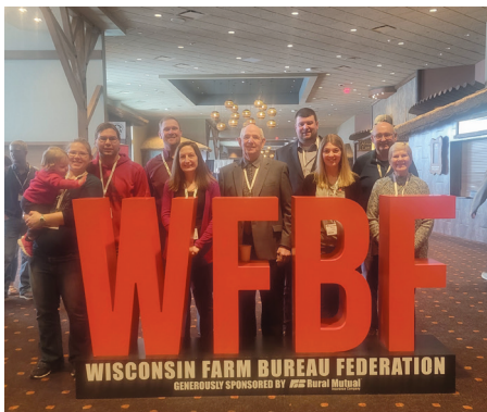
Sheboygan County Farm Bureau Board members at the WFBF Annual Meeting.