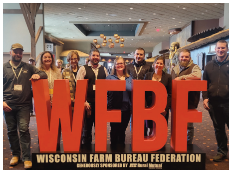
Calumet County was well-represented at the WFBF Annual Meeting.