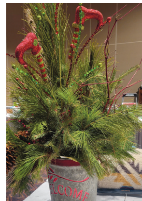
Calumet County sponsored a silent auction item, a beautiful porch pot.