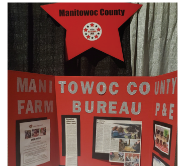
Manitowoc County Farm Bureau Promotion and Education committee had a display for a winning event through the County All-Stars program at the WFBF State Annual meeting.