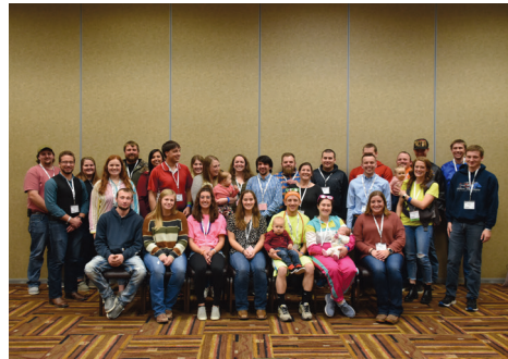
District 6 Young Farmer and Agriculturists at Friday night's district meeting.