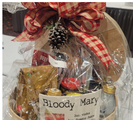
Sheboygan County Farm Bureau donated a Bloody Mary basket to the Silent Auction.