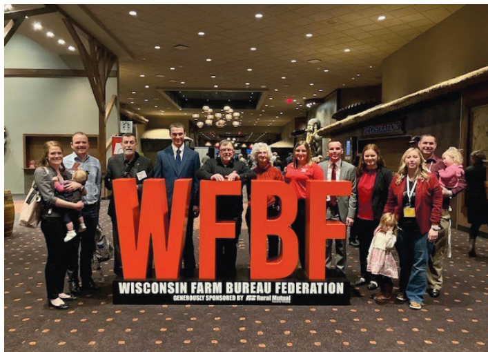
Brown County delegates and attendees at the WFBF Annual Meeting.