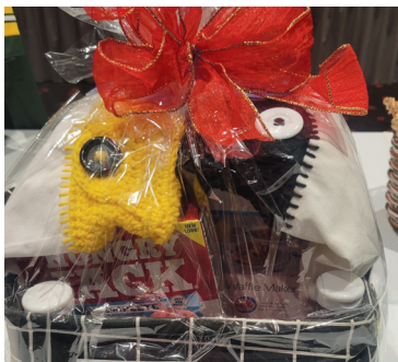
Manitowoc County Farm Bureau waffle maker basket to the Foundation Silent Auction.