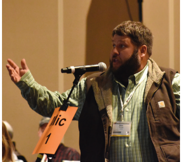
District 3 was well represented at this year's WFBF Annual Meeting.