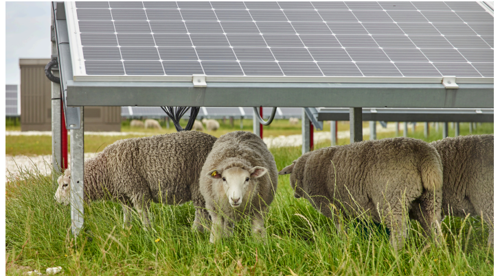
Sheep graze under solar panels in an agrivoltaics system.

Some farmers have converted the land – if the lease agreement allows – to pastureland for sheep, goats, or some other type of livestock. Research is being done to determine if there are other potential agricultural uses allowing land beneath a solar array to remain in production agriculture. You may hear these concurrent uses during the operational phase referred to as “agrivoltaics” or “ecovoltaics.”