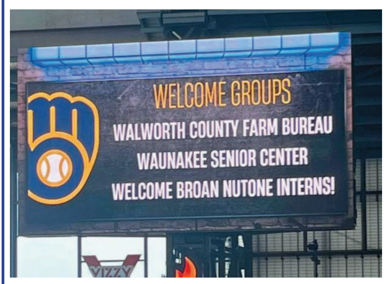
On July 11, we boarded the bus for a fun afternoon watching the Milwaukee Brewers take on the Pittsburgh Pirates! Unfortunately, the Milwaukee Brewers lost, but fun was had by all. On the way home, we stopped at Pizza Ranch for supper.