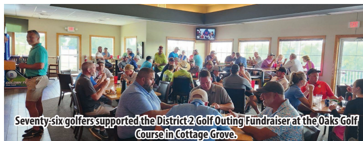
Seventy-six golfers supported the District 2 Golf Outing Fundraiser at the Oaks Golf Course in Cottage Grove.

We feel our District 2 golf fundraiser was very successful, and we are looking forward to holding another one next year. There will be more information on next year's District 2 Golf Outing coming up in future newsletters. Again, I would like to thank everyone who participated in our fundraising event. Whether it was helping with the event, contributing prizes for the raffles and silent auctions or being a hole or lunch sponsor, we couldn't have accomplished everything without your support.