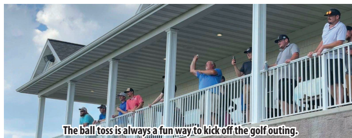
The ball toss is always a fun way to kick off the golf outing.