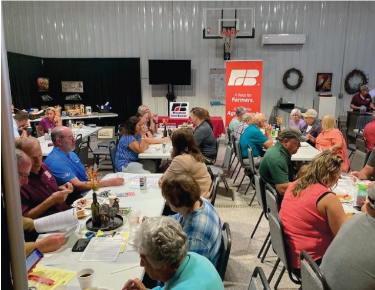
Sixty-nine members gathered at Narrows Creek Winery in Loganville for the county annual meeting on August 22.