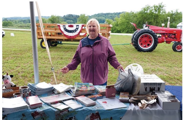
Agriculture in the Classroom celebrated June Dairy Month at the dairy breakfast.

It's always fun to be with the kids and agriculture! Don't you want to join the team and help? 2024-2025 is going to be a super year and with many new adventures on board.