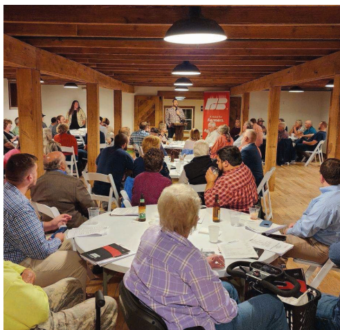
The Rock County Farm Bureau annual meeting was held on September 23 at The Barn on Prairie in Janesville.