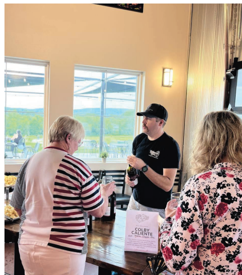
The 2nd Annual Wisco Wine and Cheese with Balanced Rock Winery was held on June 28.

The first $750 of the milk drive is being matched by Sauk County Farm Bureau and Rural Mutual Insurance: Daryl Pulfus Agency. Here is the link to learn more or donate https://gofund.me/b72ae36b .