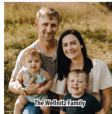
The Wellnitz Family