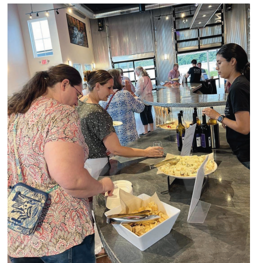
Wisco Wine and Cheese featured Sauk County cheesemakers Carr Valley Cheese and Cedar Grove Creamery along with Arena Cheese.