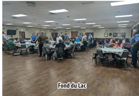
Fond du Lac