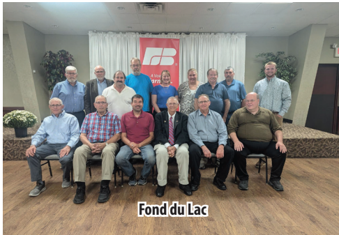
Fond du Lac