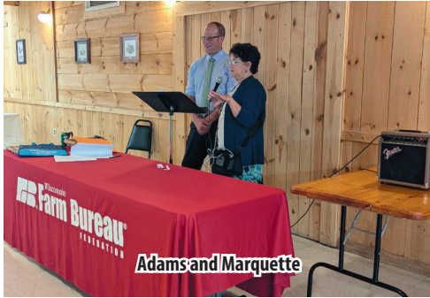
Adams and Marquette

All seven counties in the district recently held their county annual meetings. During the business meeting, members elected their county Farm Bureau board of directors, WFBF annual meeting delegates and approved county resolutions.