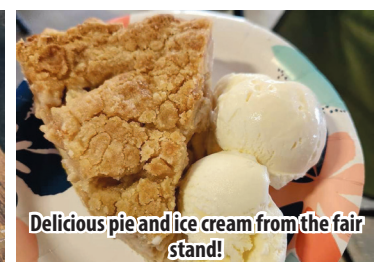
Delicious pie and ice cream from the fair stand!