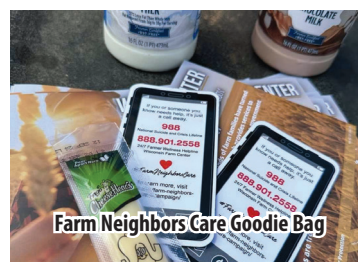
Farm Neighbors Care Goodie Bag