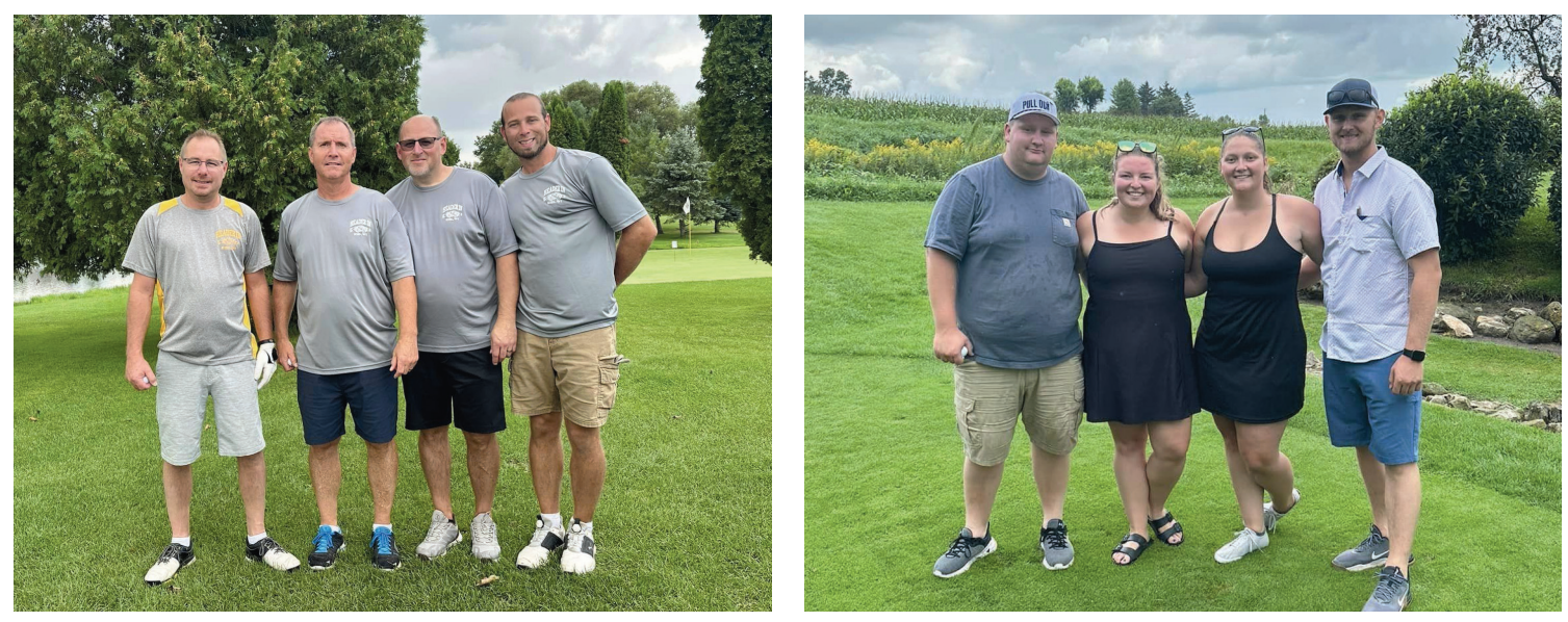
The Rural Open was hosted on August 17, 2024, at Hickory Hills Country Club. Funds raised go to the Calumet County Farm Bureau and the Calumet County Fair Association. Watch for more information next year to get your team involved.