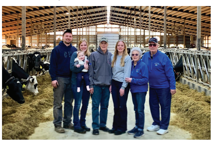
The Livestock Achievement Award was presented to Libertyland Farms.

2. We support exemptions to the FSMA Produce Safety Rule being based on covered produce sales rather than annual food sales.