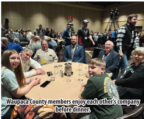
Waupaca County members enjoy each other's company before dinner.

This next year's slogan is, "Shine Bright, Lead Boldly". I am excited to see how each of you shine brightly this year and how each of you will take the next step in your Farm Bureau journey to lead boldly. As always, please reach out if you need anything or have any questions!