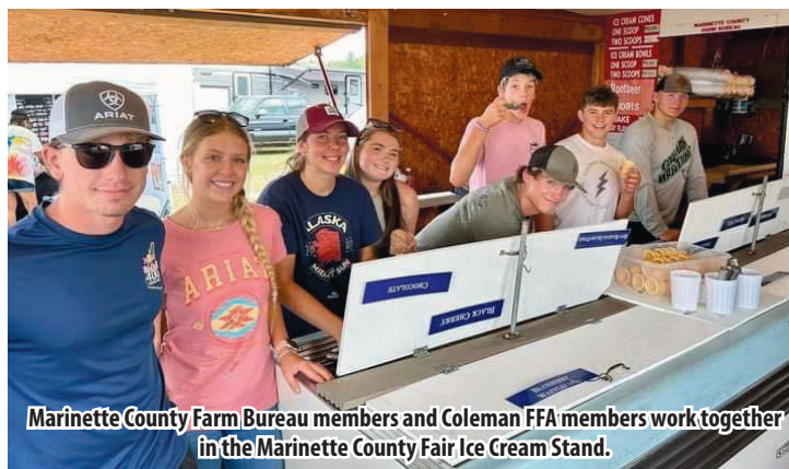
Marinette County Farm Bureau members and Coleman FFA members work together in the Marinette County Fair Ice Cream Stand.