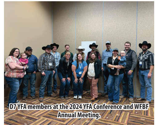
D7 YFA members at the 2024 YFA Conference and WFBF Annual Meeting.