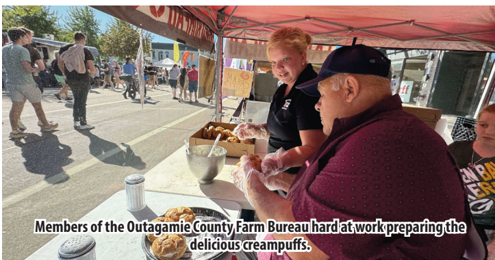
Members of the Outagamie County Farm Bureau hard at work preparing the delicious creampuffs.