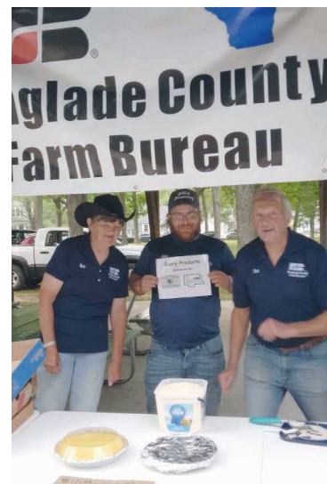
Langlade County Farm Bureau served another delicious meal at the Antigo Music in the Park.