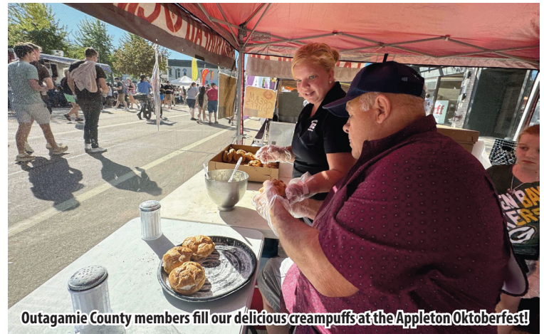
Outagamie County members fill our delicious cream puffs at the Appleton Oktoberfest!

Because of the success we had this year, we will again have a booth on College Avenue next year! So, mark calendar for September 26, 2026, to help at Oktoberfest. Again, thank you to everyone who supported or worked in the booth this year!