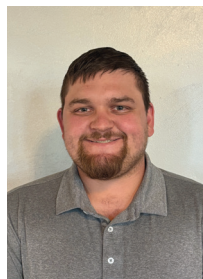
Oconto County Farm Bureau Board Member

The 2025 Oconto County Fair was a great success. There was much to do and see. At the fair we had an RC Tractor event where attendees were able to test their tractor driving skills. We had a great number of kids as well as adults participating in the event. Along with the tractor driving course we had different raffle items. Another item we had was a scavenger hunt for kids and adults to do. We have great ideas for 2026 and if there is anyone who would like to help and plan the 2026 event, please reach out to a board member.