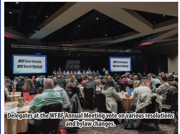
Delegates at the WFBF Annual Meeting vote on various resolutions and bylaw changes.