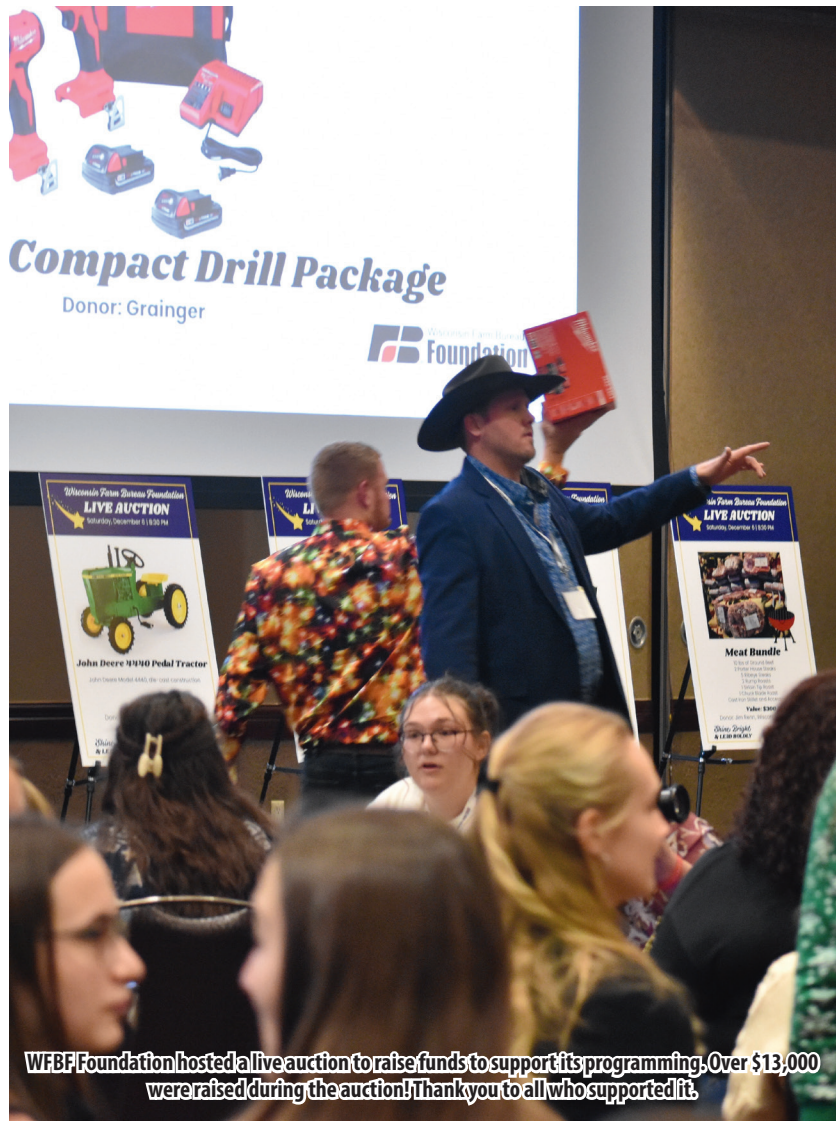
WFBF Foundation hosted a live auction to raise funds to support its programming. Over $13,000 were raised during the auction! Thank you to all who supported it.

Members are encouraged to support the programs supported by the Foundation by making tax deductible donations.