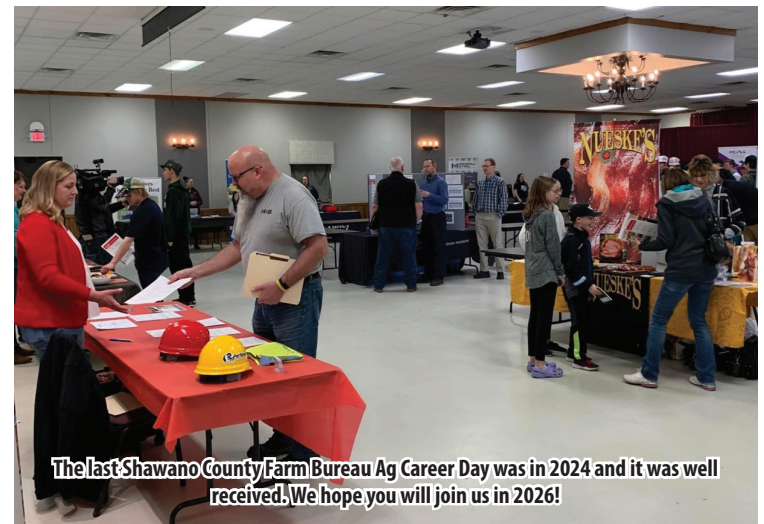
The last Shawano County Farm Bureau Ag Career Day was in 2024 and it was well received. We hope you will join us in 2026!