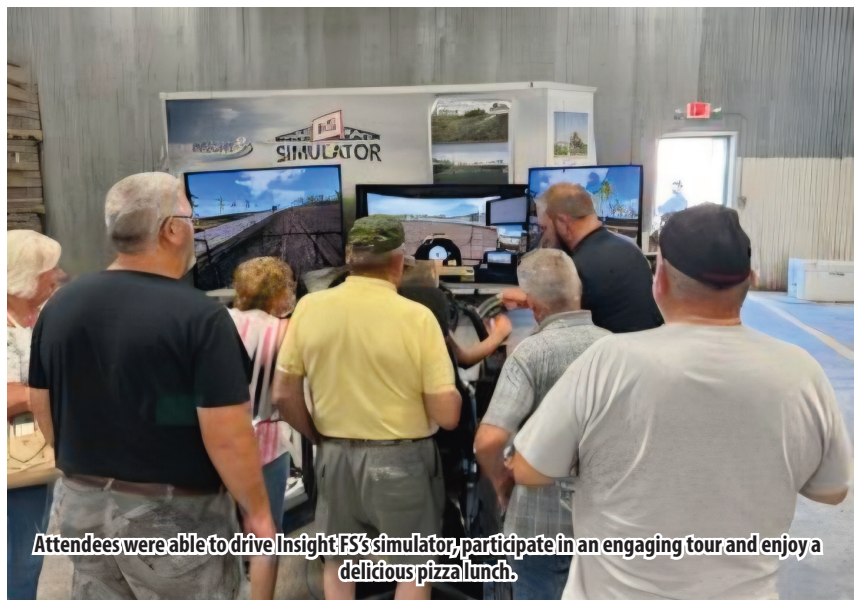
Attendees were able to drive Insight FS's simulator, participate in an engaging tour and enjoy a delicious pizza lunch.

The visit-built connections among farmers and highlighted cooperatives' importance in Langlade County's strong potato and dairy sector. Insight FS carries on its longstanding tradition of serving local producers