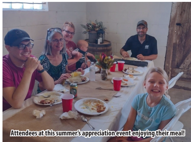
Attendees at this summer's appreciation event enjoying their meal!